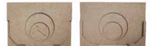
End Cap Front/Back

End Caps can be used at the end of your channel run to stop the flow of water.