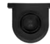
End Cap Outlet