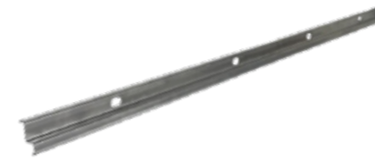
Stainless Steel Edge Rail