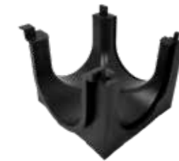
Composite Corner Unit