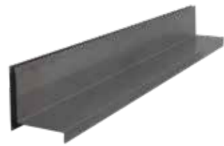
Stainless Steel Offset Paveslot (B125)