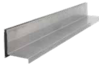
Galvanised Offset Paveslot (B125)